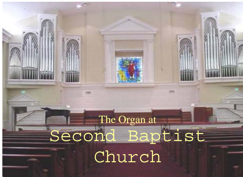
The Organ at Second Baptist Church